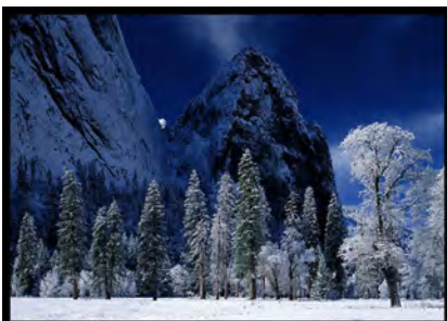
Cathedral Rocks, Yosemite NP