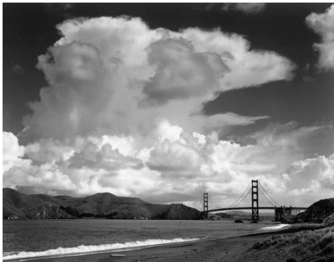
Ansel Adams: Golden Gate Bridge from Baker Beach 1953

Under the learning page, you can see some of the meeting notes and presentations of various professionals as far back as 2010.