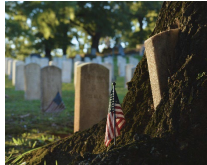
Intermediate: Valencia Stonewall