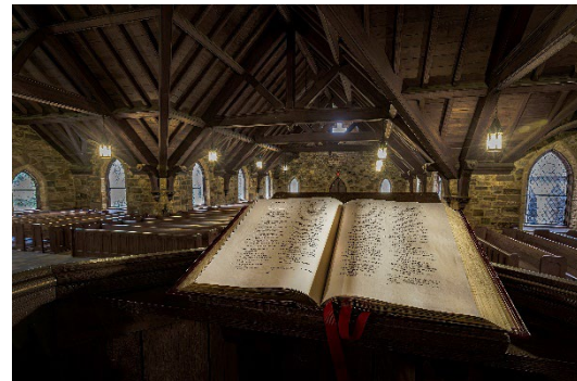
Master: Jason Blalock