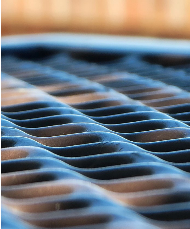
Mary Jane: Close up of a picnic table