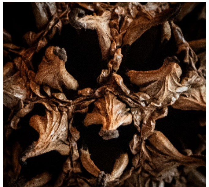
Susan: Close up of a sweetgum ball