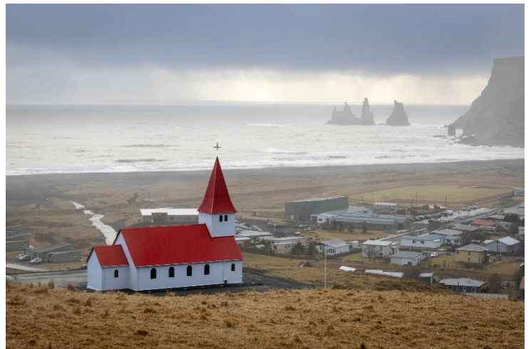
Master: Jason Blalock