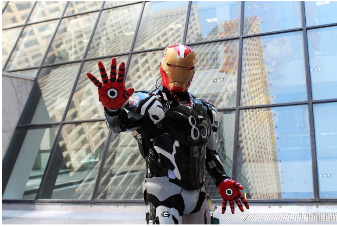
Junior: December Champion