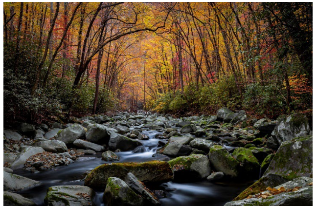
Master: Jason Blalock