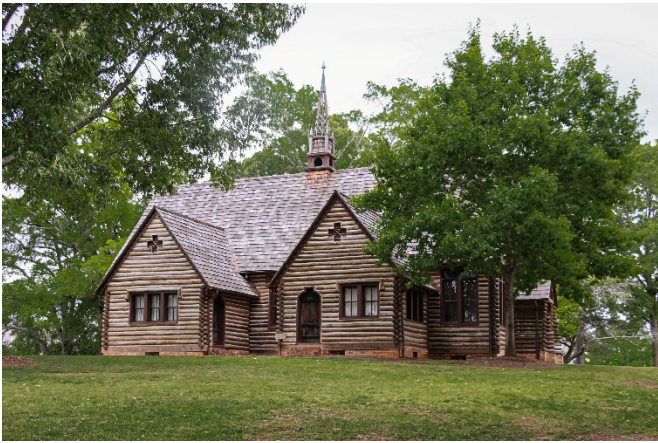
Junior: December Champion